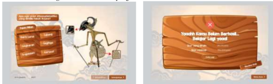
Figure 3. Worksheet Ethnomathematics and Scoring