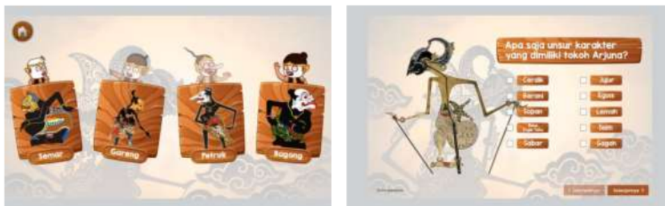
Figure 2. Character Wayang and Worksheet Character Education